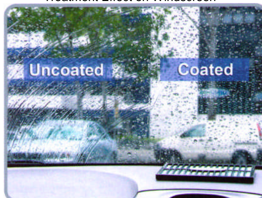
Treatment Effect on Windscreen

Nanoprotect® AG build-up of dust, grease, oil are simply repelled with water, while tar, dead bugs and plant resins are easily removed without the need for scoring or use of chemical cleaners.